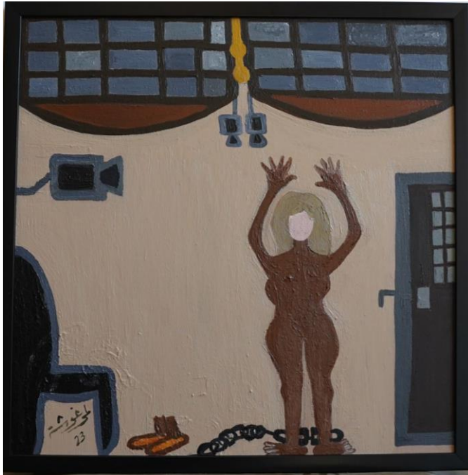
A Body Facing Naked Search (23/10/2023)